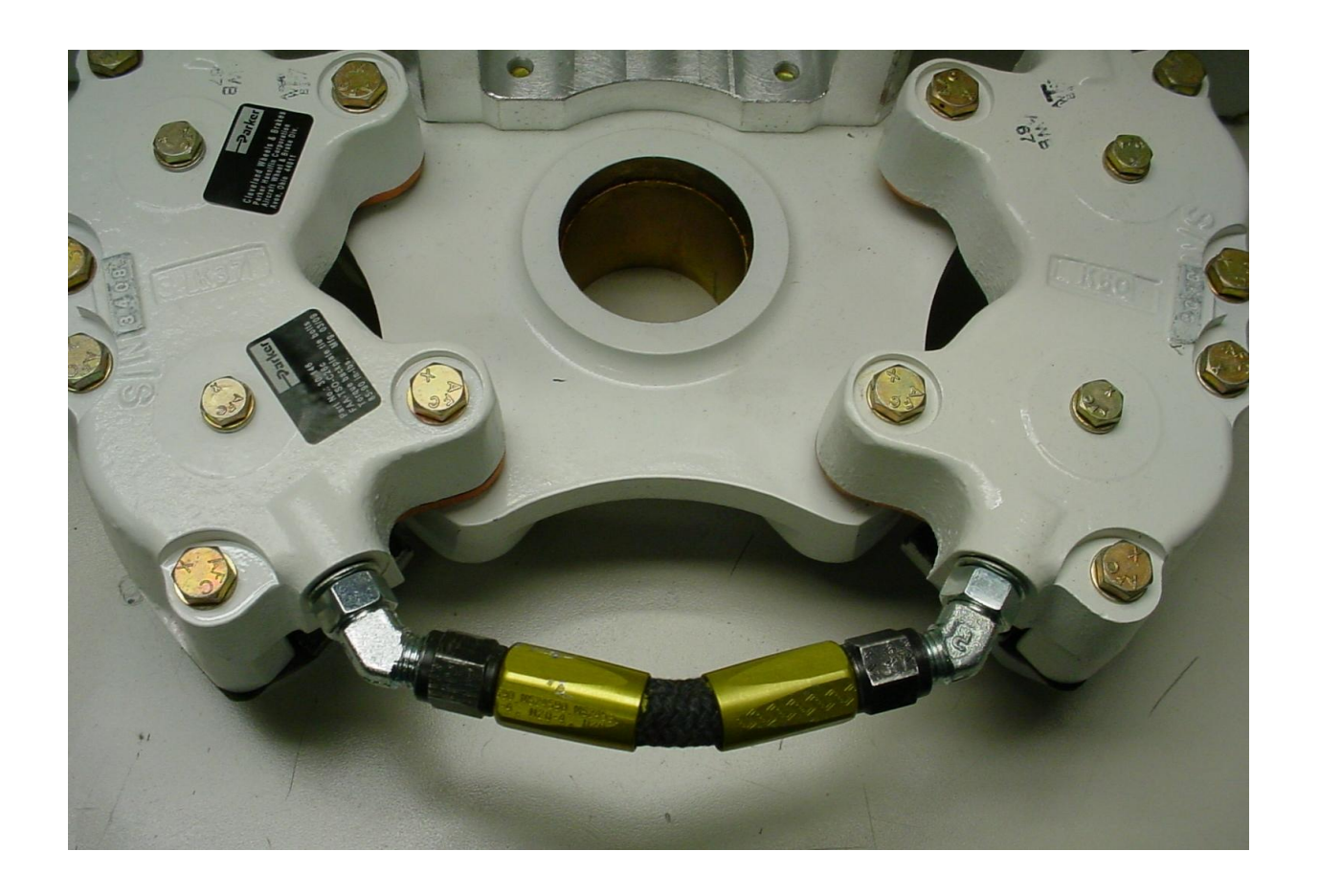
Figure 1 30-146 Brake Assembly - Interconnect Hose Installation Top View